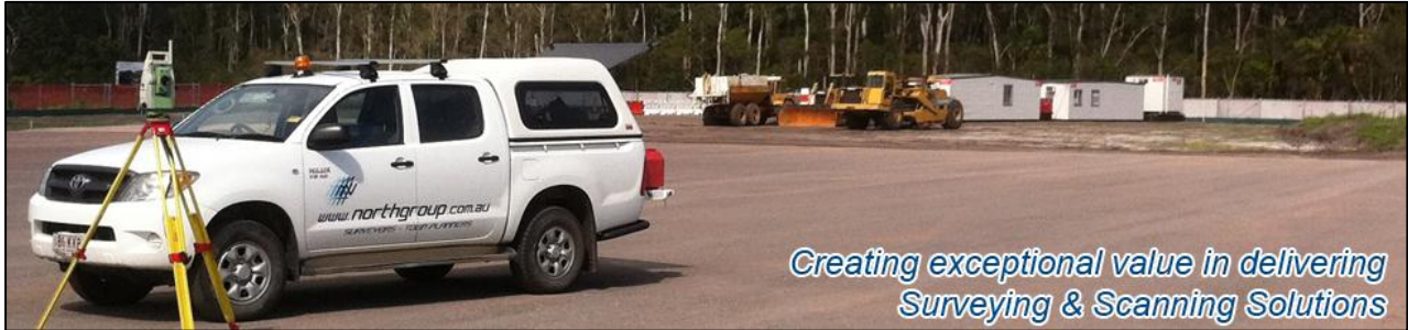
Creating exceptional value in delivering Surveying & Scanning Solutions

www.northgroup.com.au | feedback@northgroup.com.au